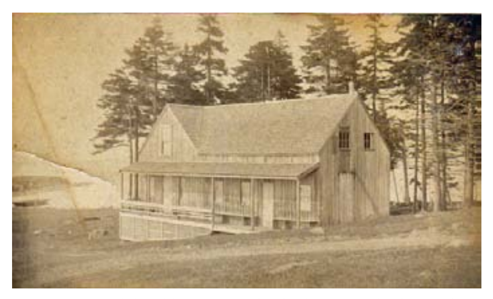
New Acquisition: Each door of this Ocean Home boarding house is covered with names of people who stayed at the boarding house beginning in 1889.

The Society would be grateful if you decided to send in your membership or membership renewal dues with this newsletter. You are welcome to use the form below. Many of you have missed several years. We will welcome you back.