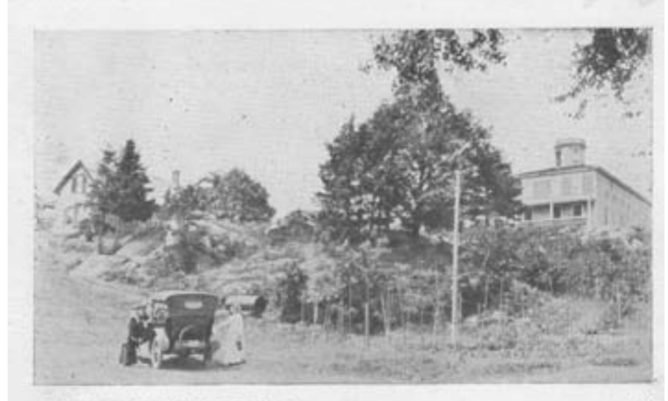
CUNDY'S HARBOR, ME. The Old Hotel

Available for sale at the Harpswell Historical Society