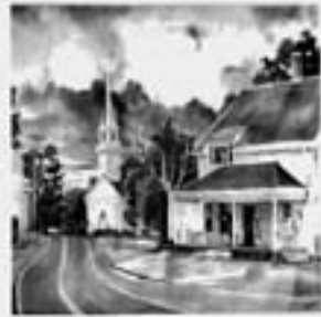
A Visit to Harpswell Historic Park

Fortunately, the Ethel held her own against the wind all night and made port the next day, but nine other vessels were wrecked that night on that same stretch of coast, with considerable loss of life. Moreover, the New York morning pa