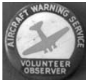
Badge for World War II volunteer observers