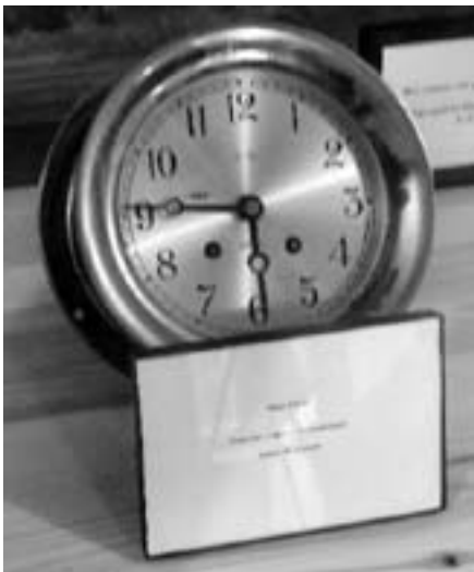
Eight Day Chelsea Ship’s Clock

We have received a coffee grinder. This was found by the front door of the Museum.