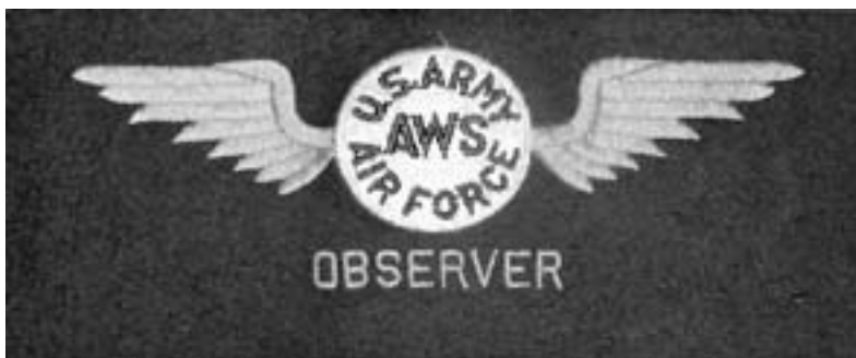
Arm Band for the Aircraft Warning Service volunteers during World War II

Our Society has become a sponsor of this very local group of thespians. Plays have been held in Centennial Hall for One Hundred Twenty-Nine years. This year's play was The Red Hot Mamas . It was sold out for both performances. We wish this group good success and much longevity.